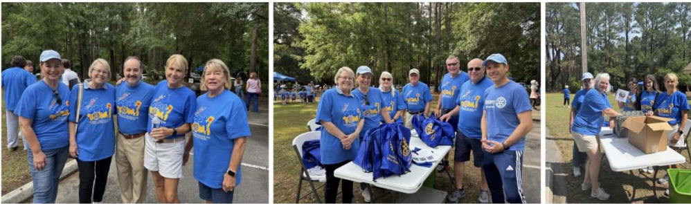
Text and photos courtesy of the Hilton Head Island Rotary Facebook page